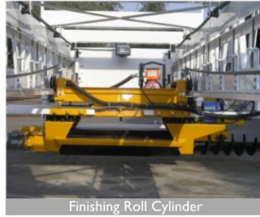
Finishing Roll Cylinder